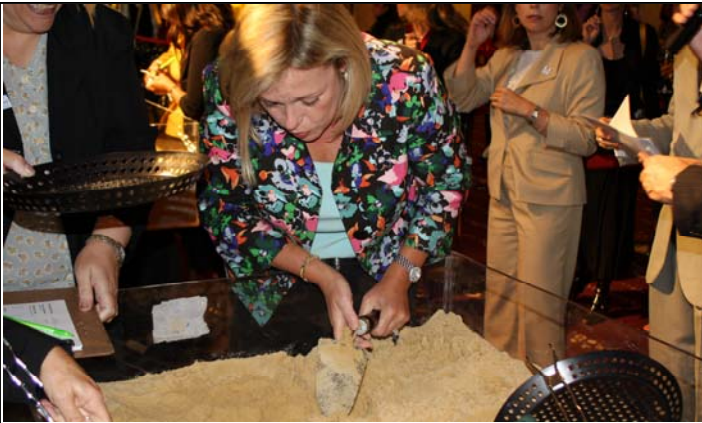
Attendees try their hands at the Diamond Dig at Stepping Out In Style.